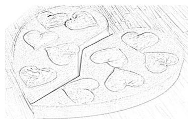
SOFA MADE OF LOVE